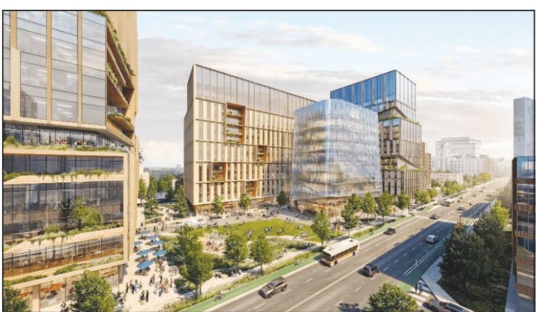
A rendering of the proposed Longwood Place project.