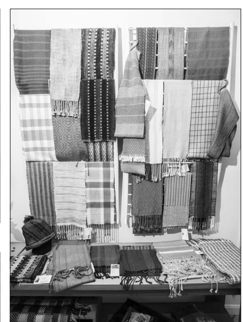
Work on display and for sale at South End Woven Studios.